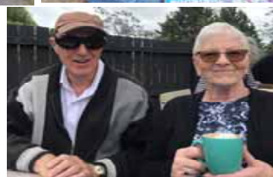
State-wide Jazz Jam 2025 Kentish Hotel Oatlands