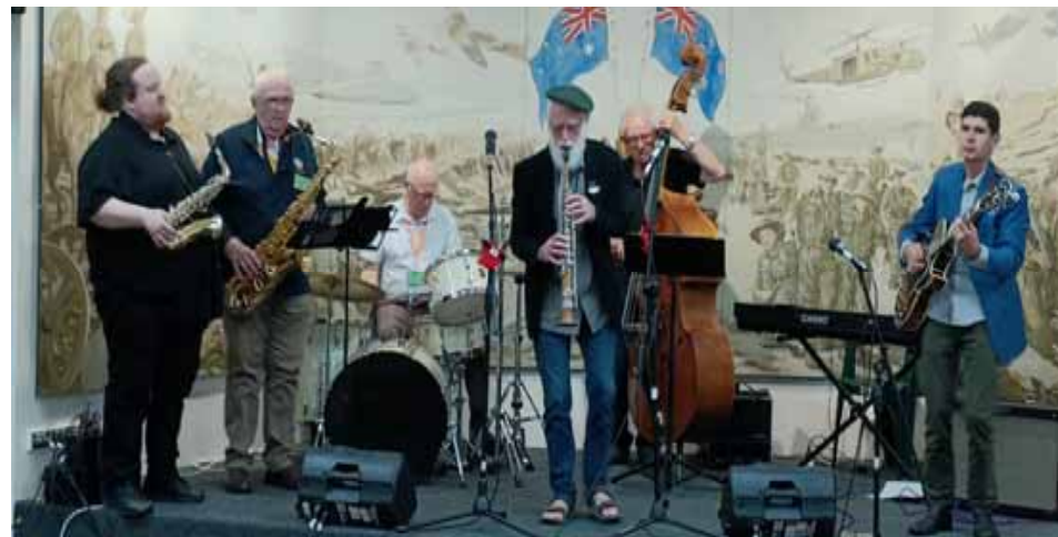
Thank you to all the musicians who came along to our Christmas Jazz Jam in December.