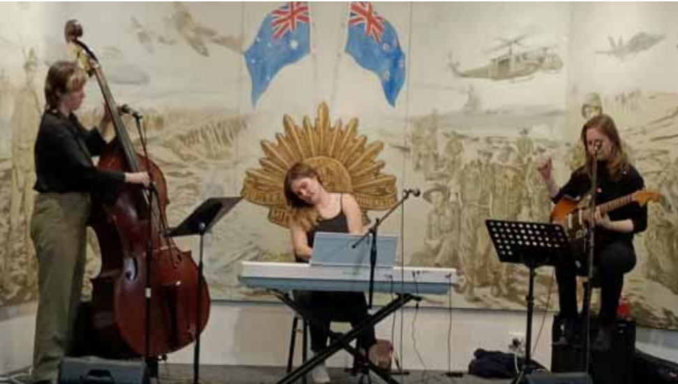
Above - Aurora Ensemble (August Jazz Club) Below - LCM (September Jazz Club)

Jazz Club meats on the second Tuesday of each month (except January) at the Claremont RSL 9 Bilton St Claremont.