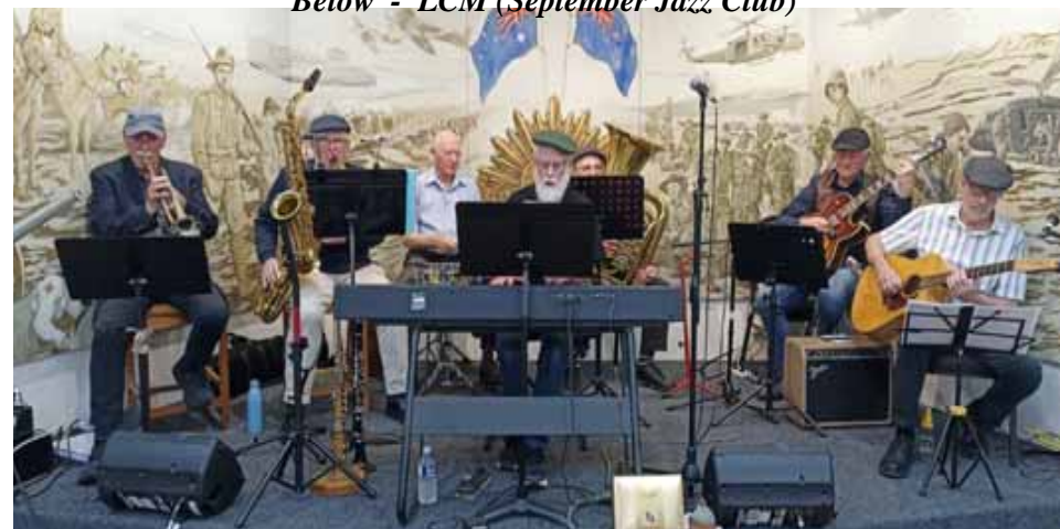
Below - LCM (September Jazz Club)