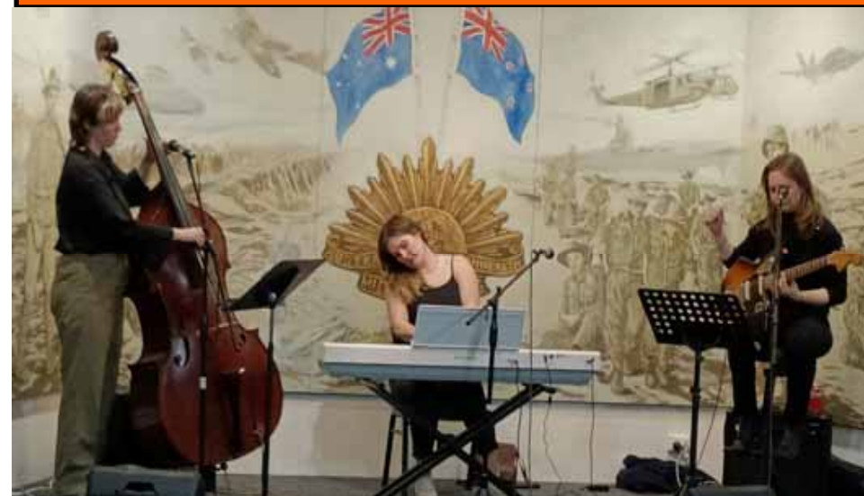
Above - Aurora Ensemble (August Jazz Club)

If you are interested please contact Kaye Payne : 0412 825 967