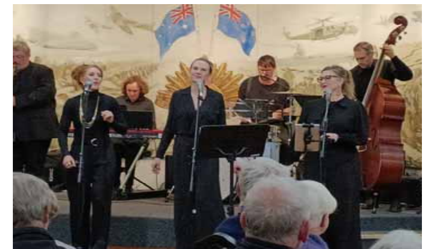
Above—June Jazz Club SWOON Below - July Jazz Club The JB Jazz Quartet.