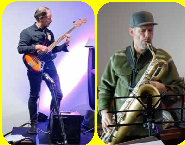
Pictured - just a few choice pics from Taz JazzFest

Promoting Australian Jazz and Jazz in Tasmania