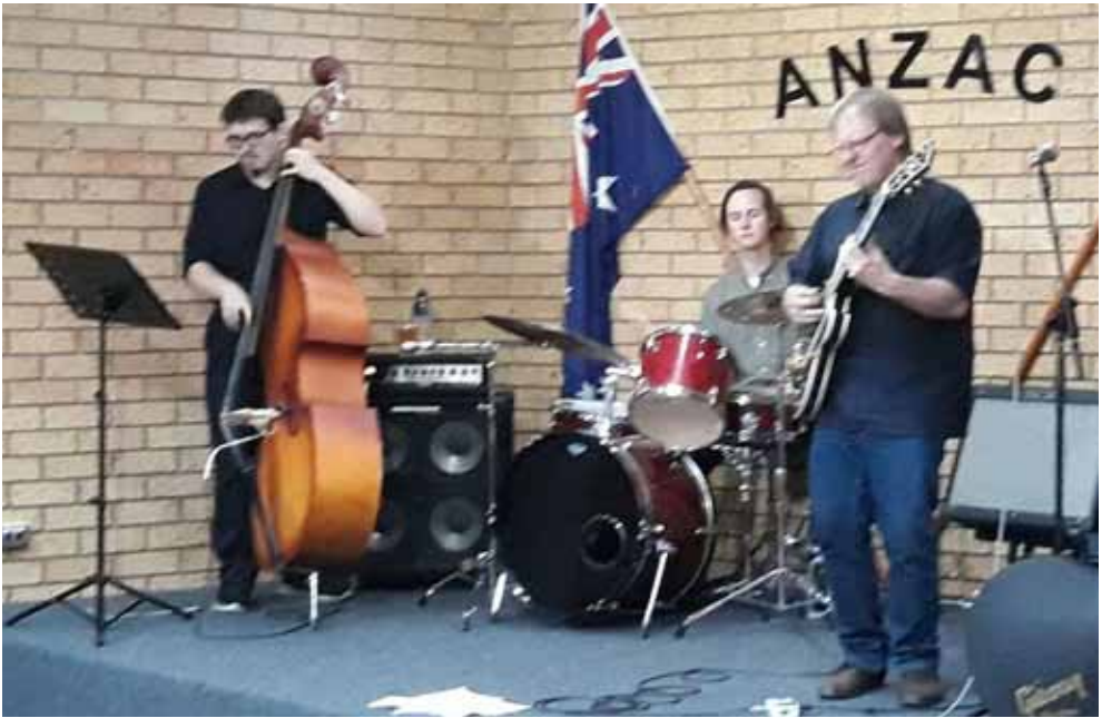
Above - November Jazz Club, Freeloader Below - Les Coqs Incroyables